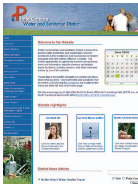
Above: District home page at www.plattecanyon.org