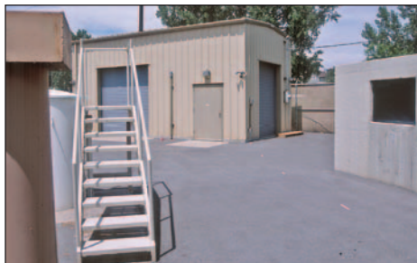
Platte River Sewage Lift Station

A fourth construction project proposes connection of Platte Canyon's main out-fall sanitary sewer to a new interceptor sewer being constructed by Roxborough Park Metropolitan District . If an agreement is reached between Platte Canyon and Roxborough, Platte Canyon will be able to remove its Platte River Sewage Lift Station from active service. Construction necessary to by-pass the lift station and